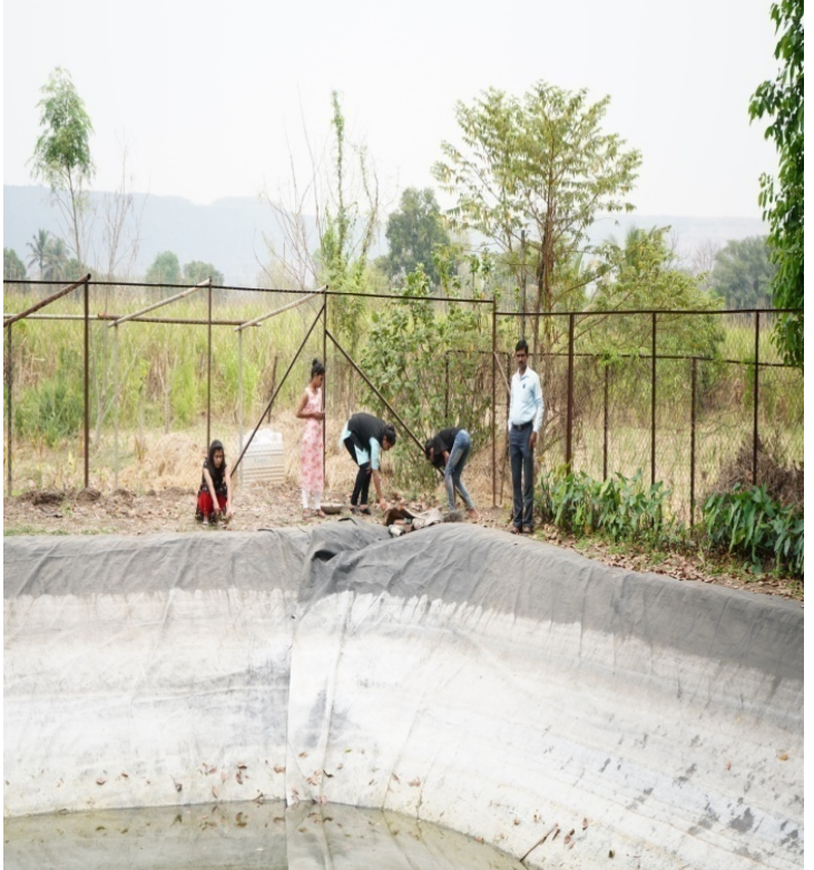
Students visited the farm pond to get information about size, material, technique, piping