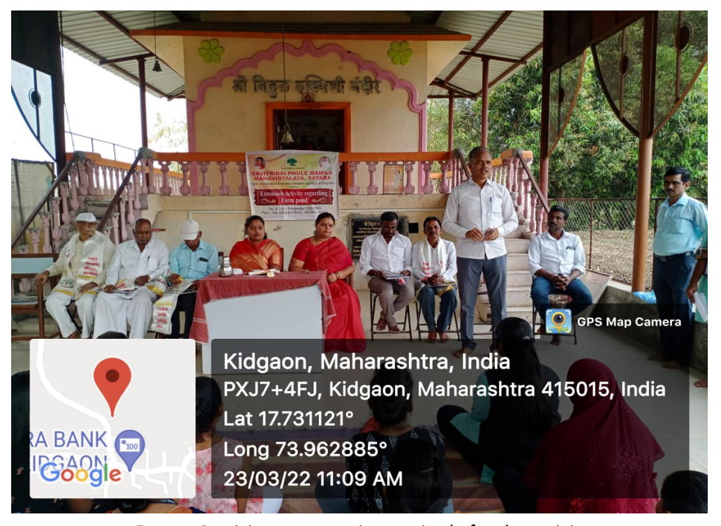
Farmer Participant expressing gratitude for the activity