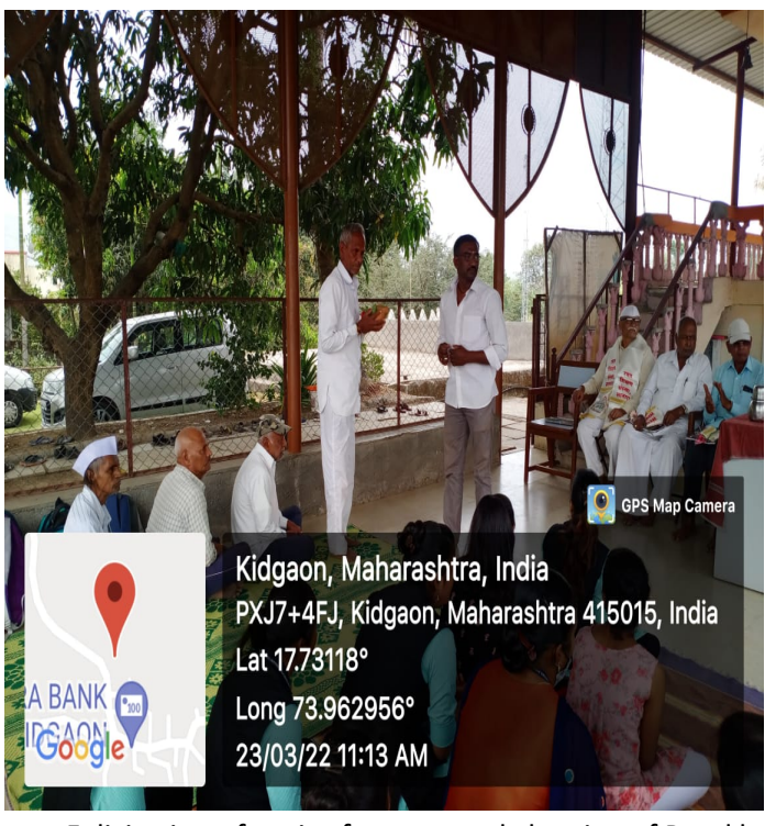
Felicitation of senior farmers and cleaning of Pond by students