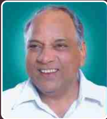
Hon'ble Sharadchandraji Pawar