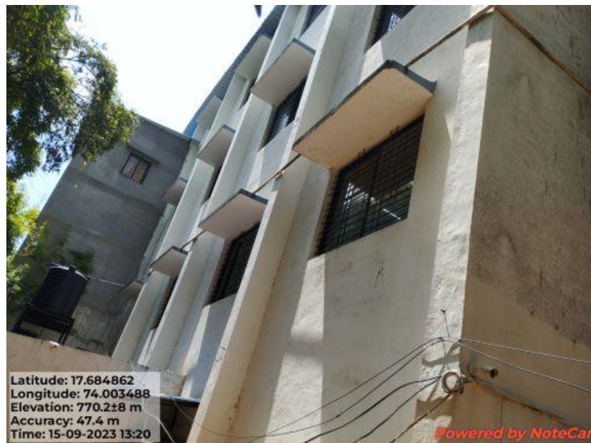
Reuse of water