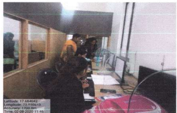
Network Resource Centre Facility