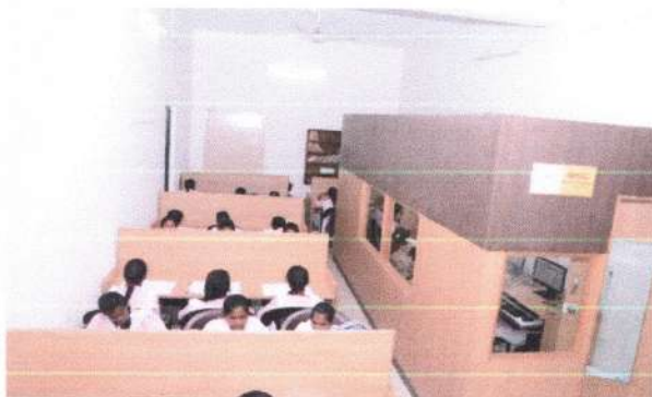
Reading Room Facility