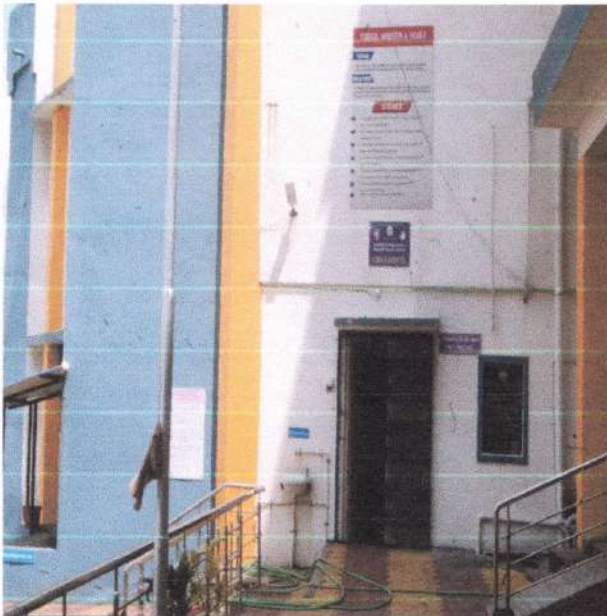
Ladies Hostel Building