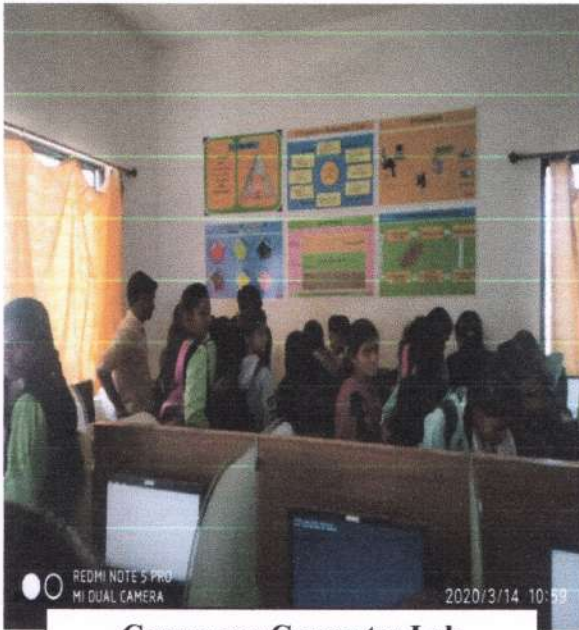
Commerce Computer Lab