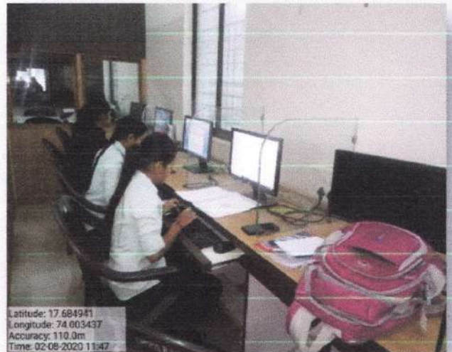
Network Resource Report