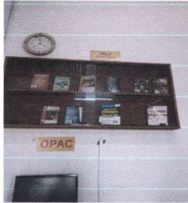
OPAC and New Arrival