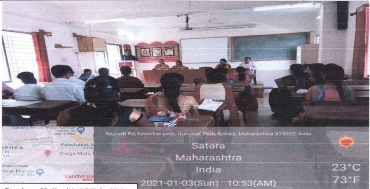
Seminar Hall with ICT facilities