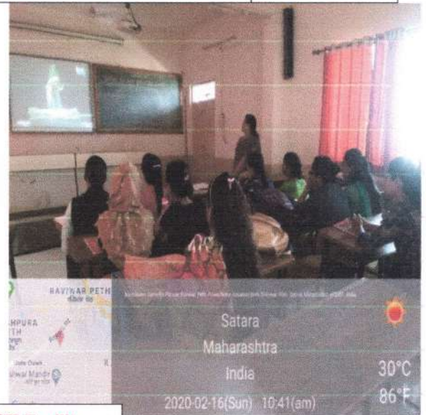
Classrooms with ICT Facility