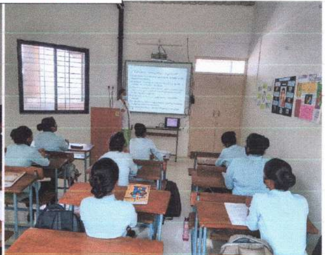
Classrooms with ICT Facility