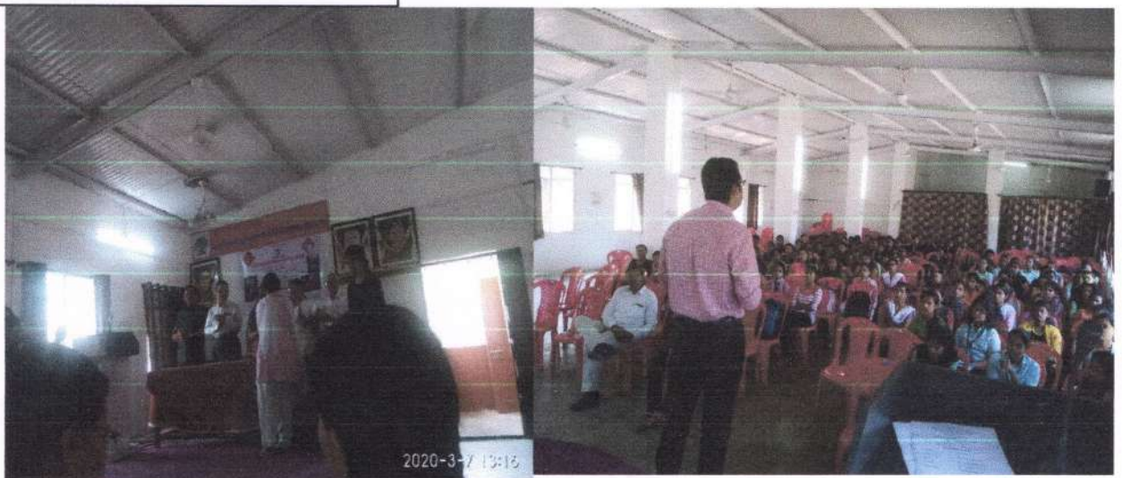
Auditorium with ICT facilities