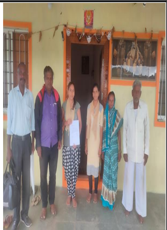
Personal visits for admission to the Girl Students’ home and counseling their parents : 2021-22