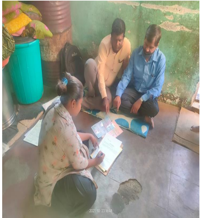
‘College At Your Doorstep’ -Teachers while counseling Parents & students for admission