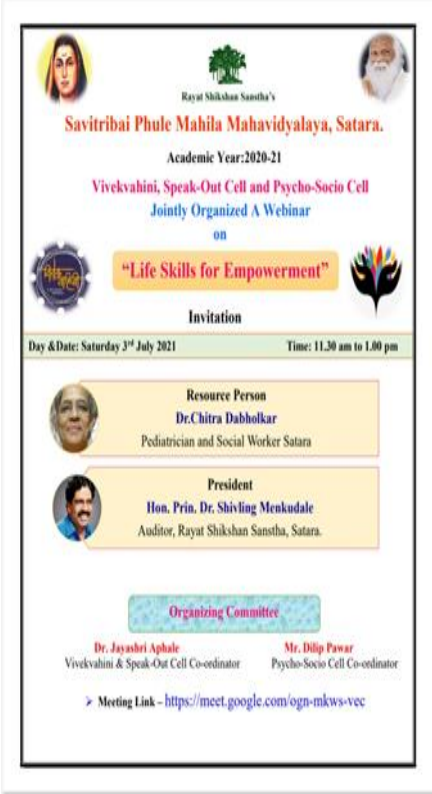
03/07/2021: One day workshop on Life Skills for Empowerment