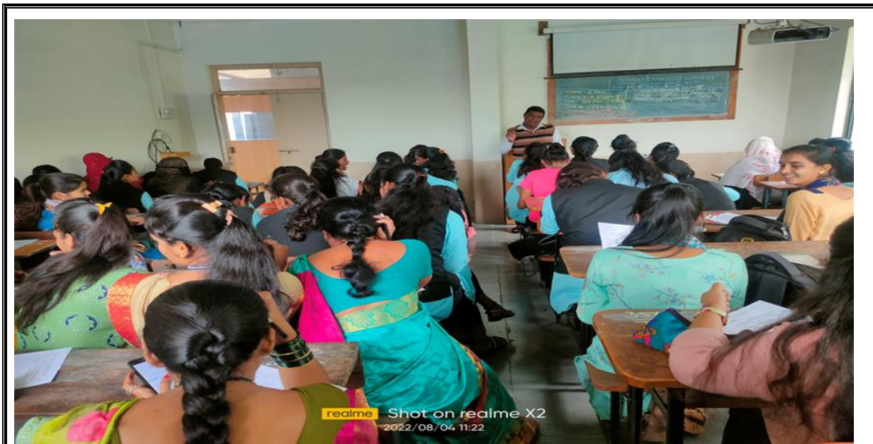
Dt.08.04.2022 A group Counselling Session conducted the students about exam stress