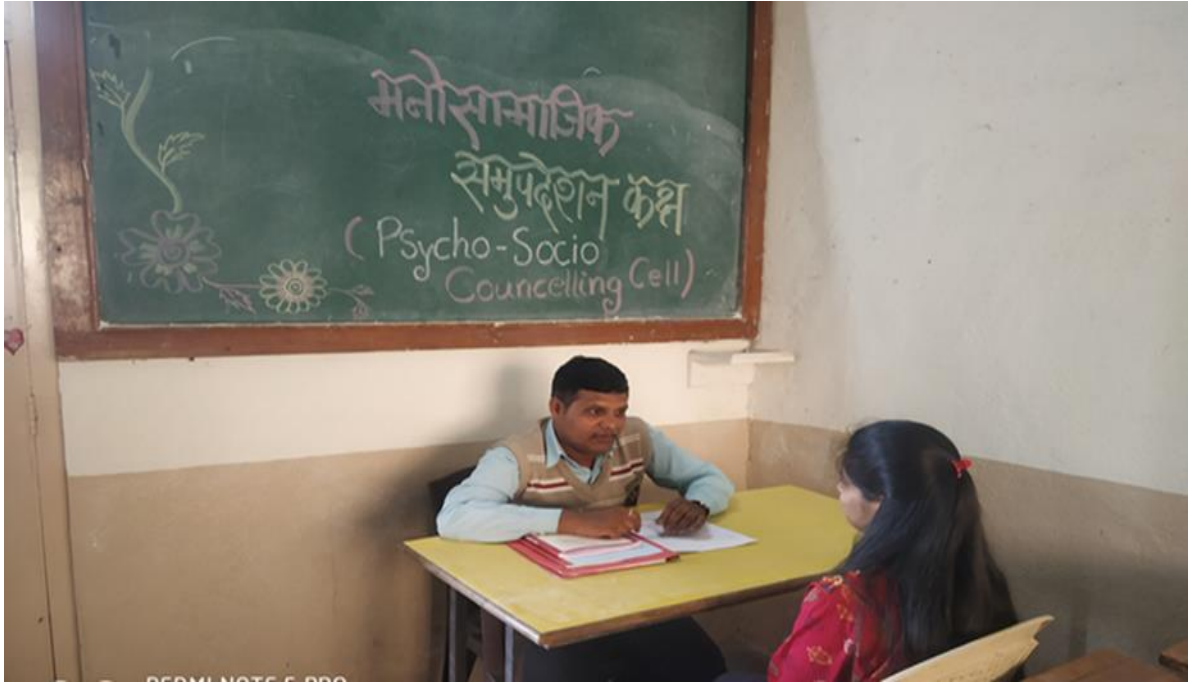
Personal Counselling Session