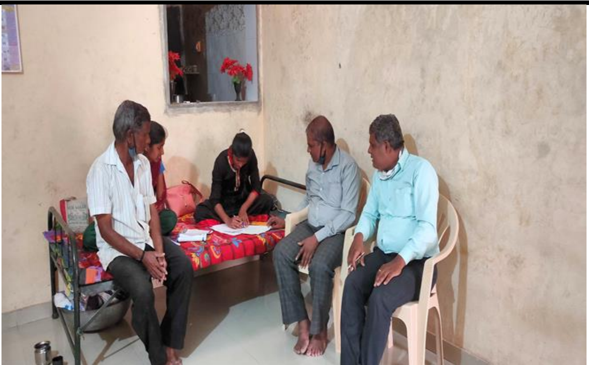
college at your doorstep -Teachers while counseling Parents students for admission