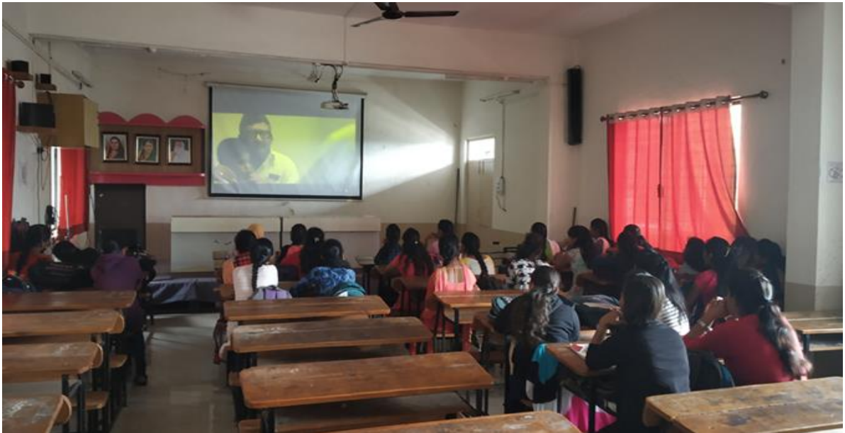
Organized session for Social Awareness and Self-Regulation