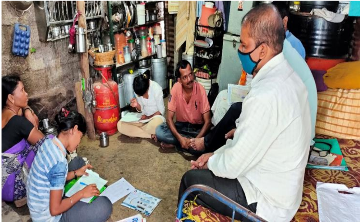
college at your doorstep -Teachers while counseling Parents students for admission