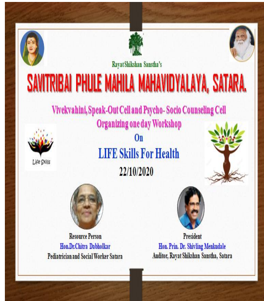
Life-Skills Workshops on Health Date – 22.10.2020